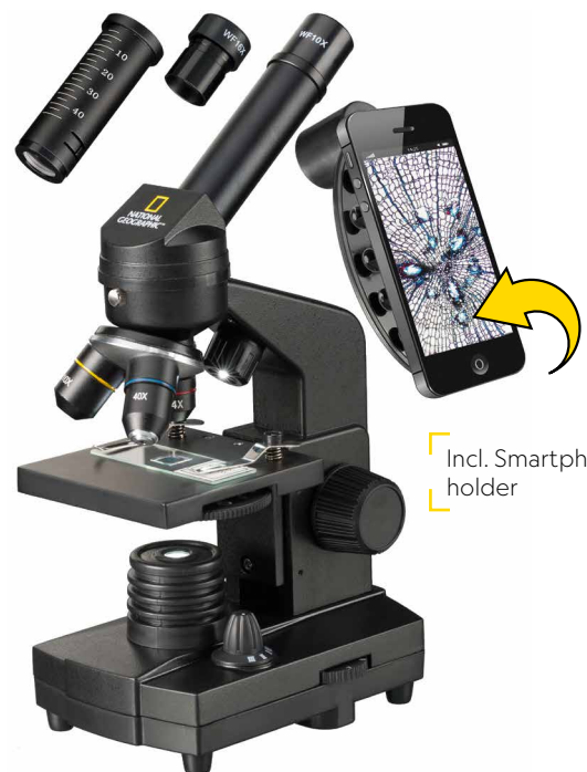
Incl. Smartphone holder