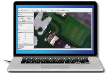
USB eyepiece camera